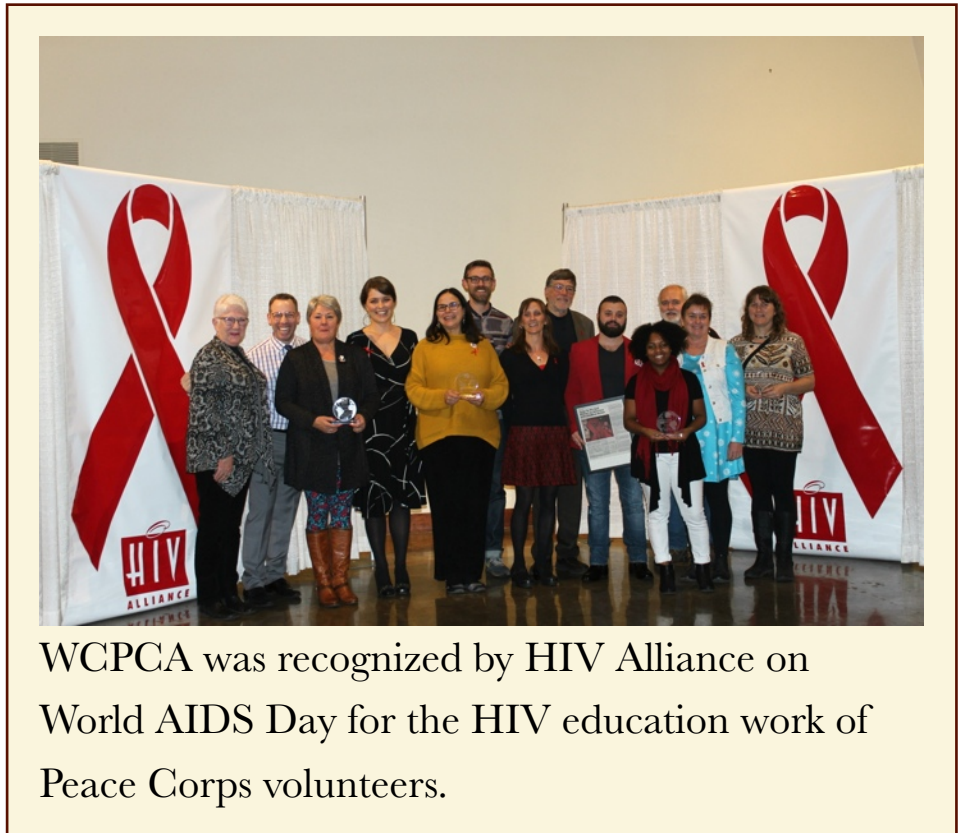
WCPCA was recognized by HIV Alliance on World AIDS Day for the HIV education work of Peace Corps volunteers.