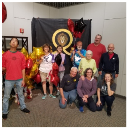
WCPA MEMBERS AFTER CLEAN UP WAS COMPLETED

Contact Gary Cornelius (South Africa 12-13) at garycorn@quixnet.net to reserve your today.