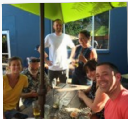
JULY PUB NIGHT