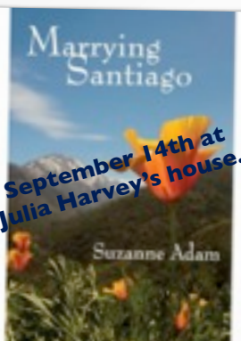
SEPTEMBER'S BOOK CLUB SELECTION