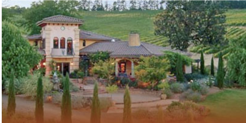
Pfeiffer Vineyard in Junction City.

small cover charge (TBD, but between $5-$10 per person) everyone can enjoy appetizers and fine wine in a beautiful setting.